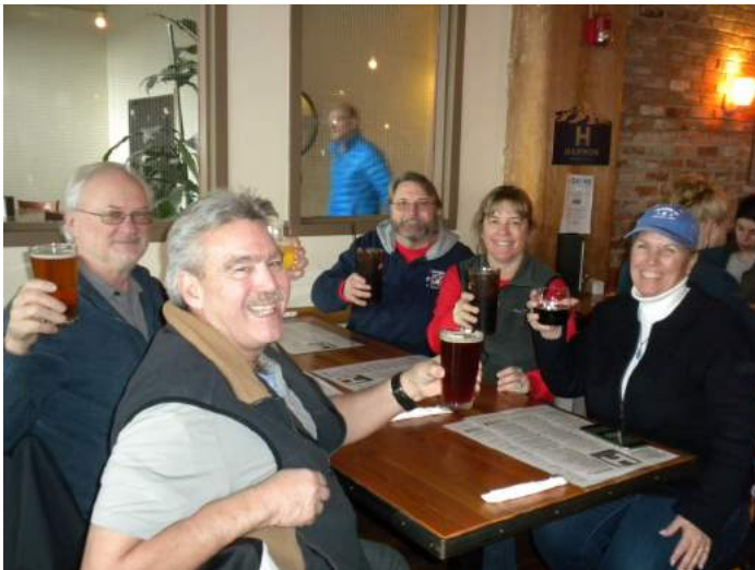
Group lunch at the Harmon Pub