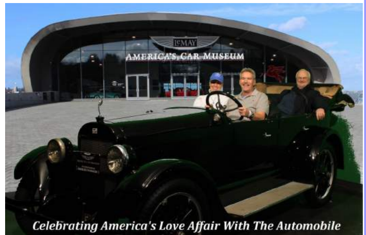
Celebrating America's Love Affair With The Automobile