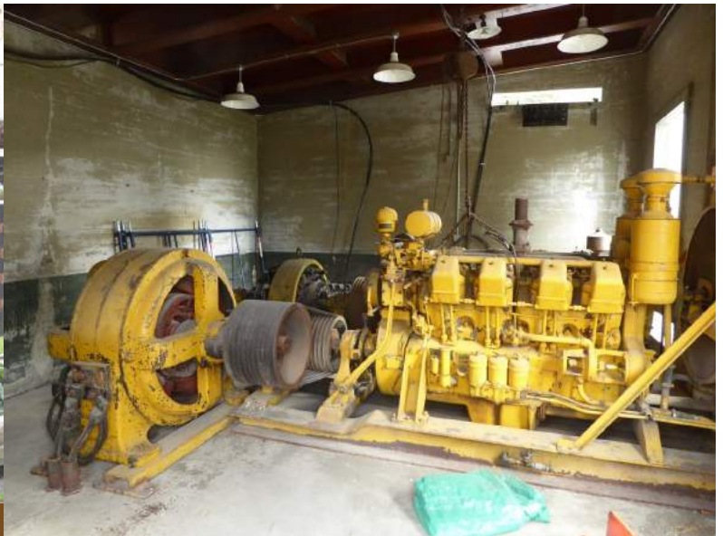
Photos Around Rosario from our October Rendezvous.