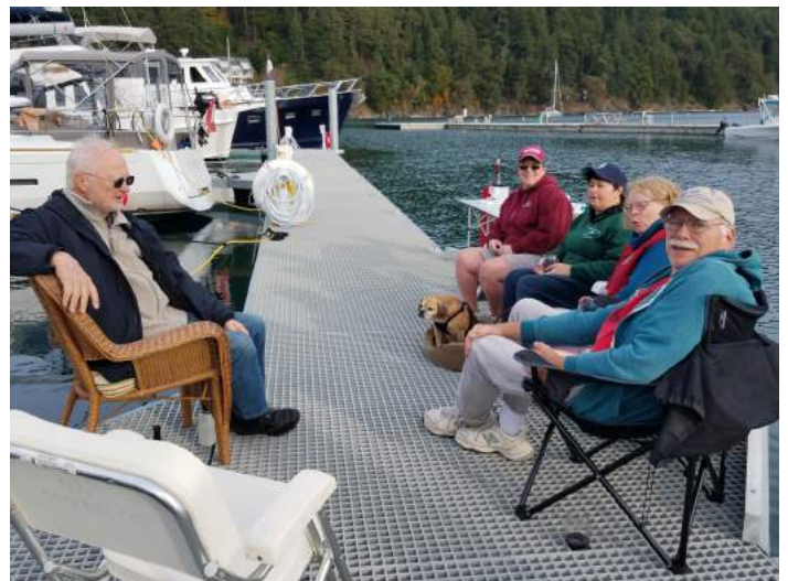
The dinner bunch on dock Saturday.