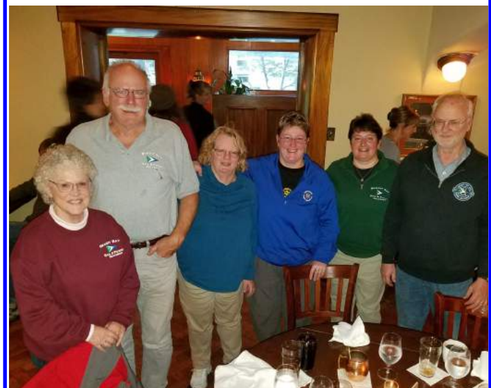
Here we are at Rosario Friday Dinner