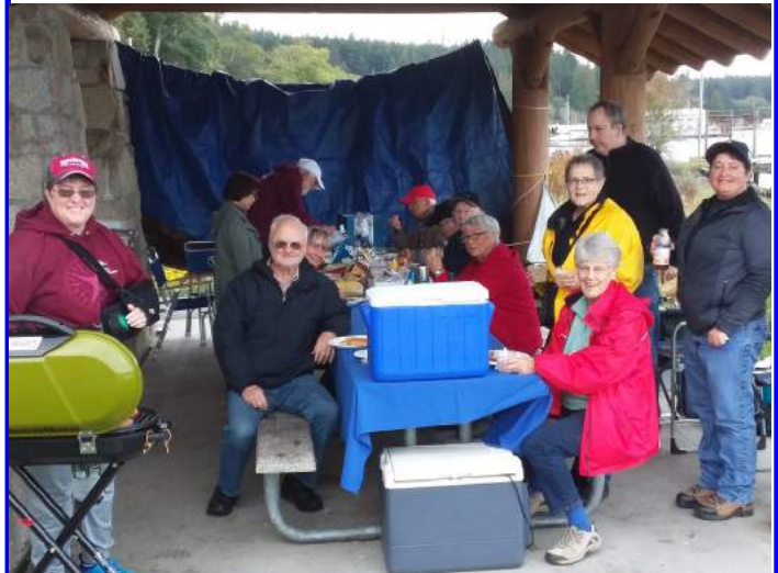
The gang at Coronet Bay. Note the Fancy Backdrop!