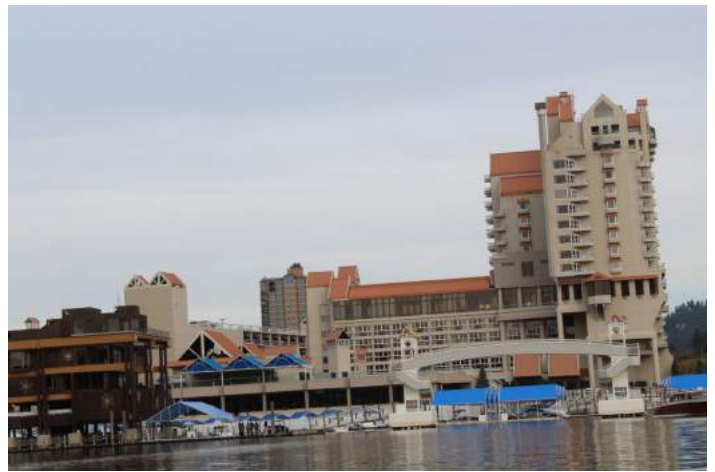
The Coeur d'Alene Resort