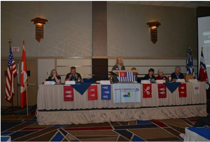
District Bridge at Head Table