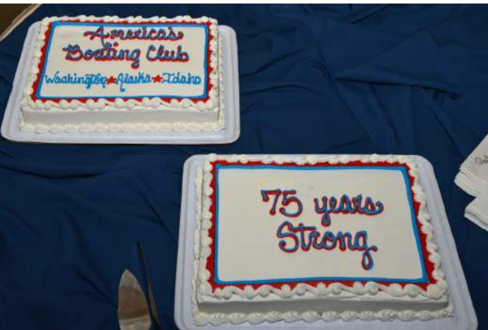
District 16 is 75 Years Old