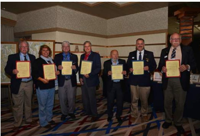
Awards for Squadrons entering for Chapman Award