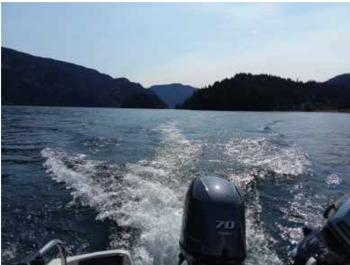
Boating cruise and lunch stop on Lake Whatcom