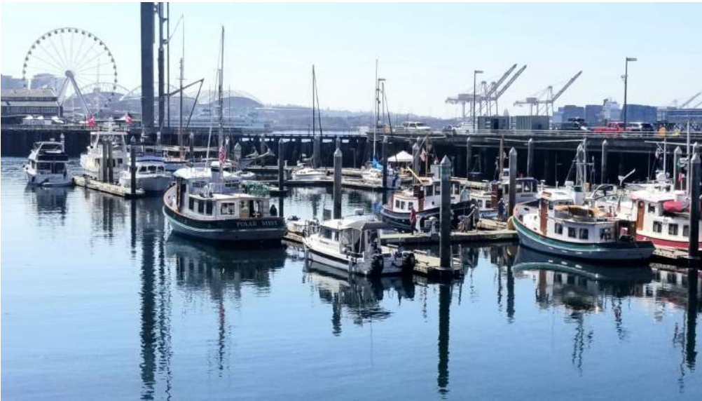
Our 2 boats. Harmony in foreground and Quiet Time with black mast rear center