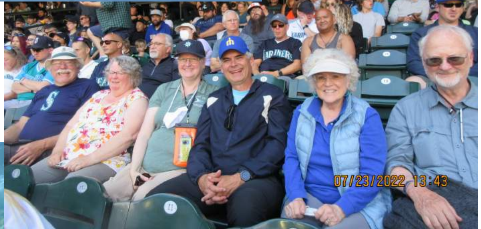
The gang at the Mariners game