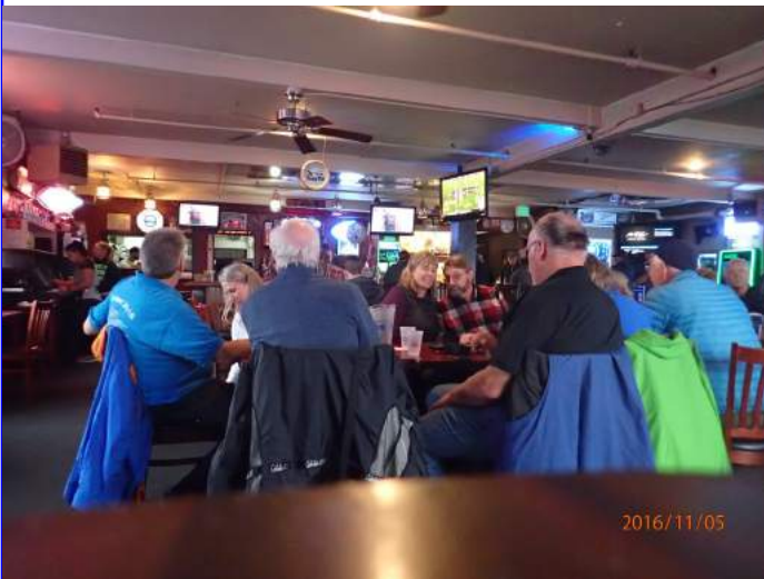
At Rock the Dock Pub . Foss Waterway, Tacoma