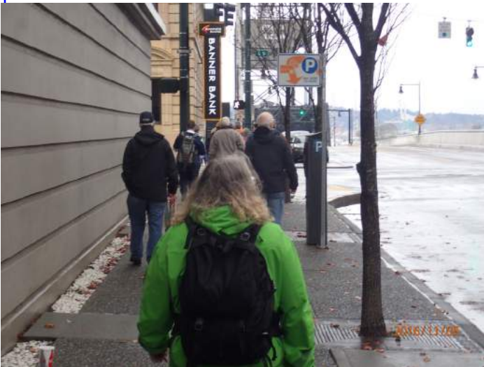
Still raining on soggy group as they walked to lunch