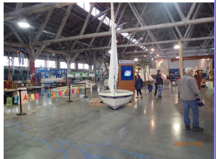
Another shot inside museum.

It was a soaking wet day and we were all drowned rats as we had to walk about 3/4 mile in the rain to the bus back to the train station but it was a wonderful time anyway.