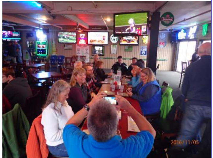
More of happy group drying off at Rock the Dock