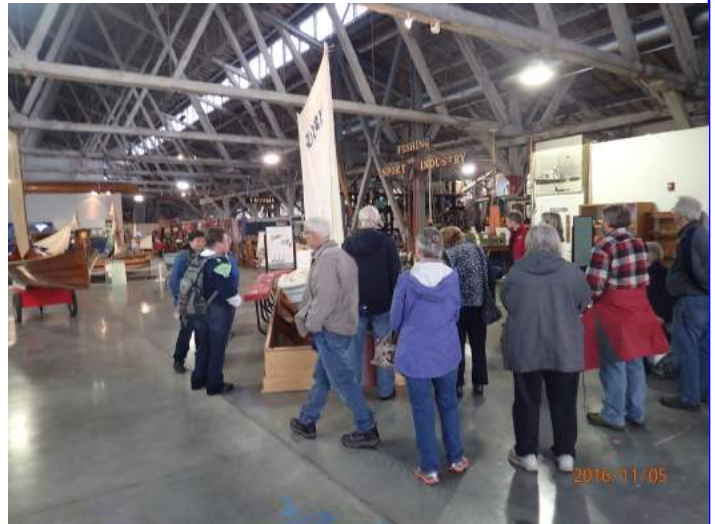
Inside Foss Seaport Museum. We got a private tour.