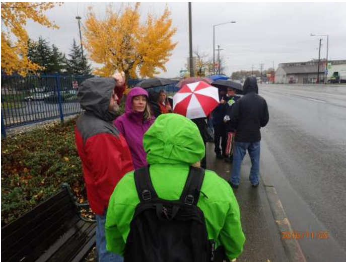
Waiting in the pouring rain at Tacoma Amtrak station for bus