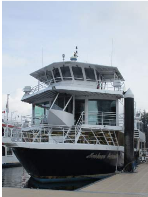
Harbor Princess Indian Arm Cruise boat