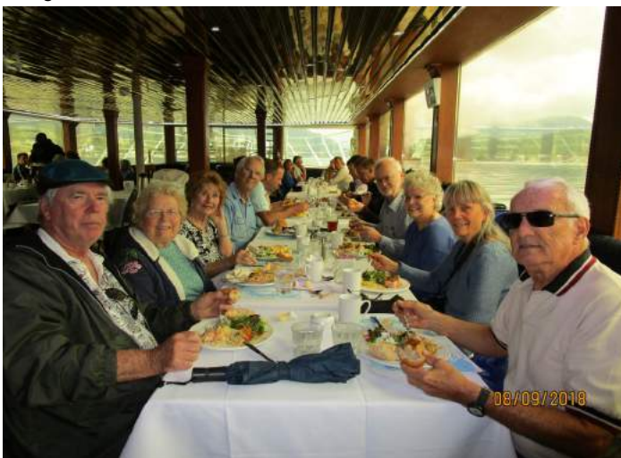
Cruising lunch on board Vancouver's Indian Arm Cruise