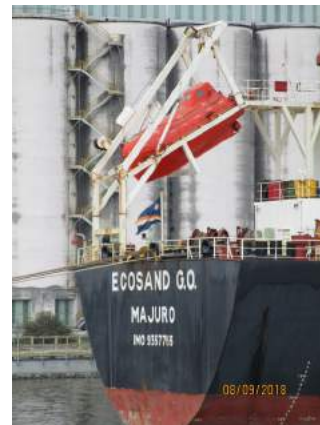
We don't ever want to have to use an escape pod like this.