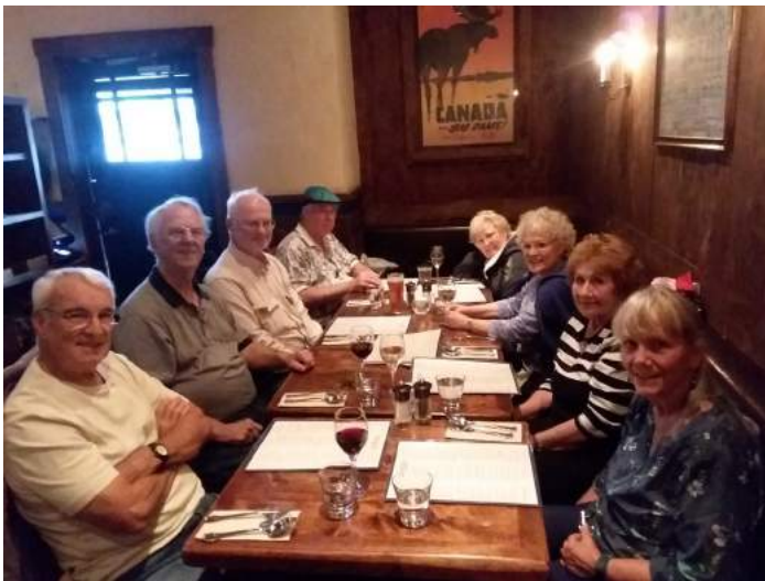
Friday night dinner at Burgoo i Vancouver's Mount Pleasant neighborhood.