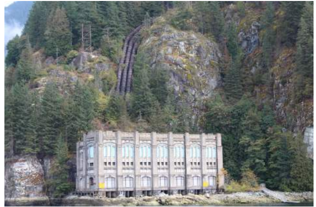
Buntzen No. 2 power plant built in 1912 (designed by English architect Francis Rattenbury)