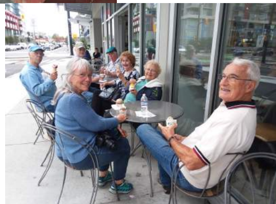
Gelato break at Amato in Vancouver before heading back to US