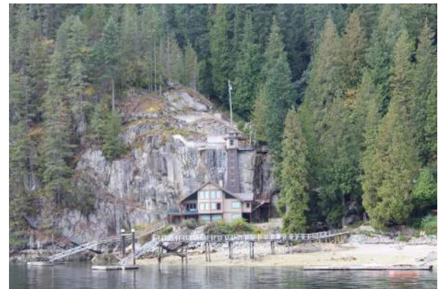
Remote housing (no roads)