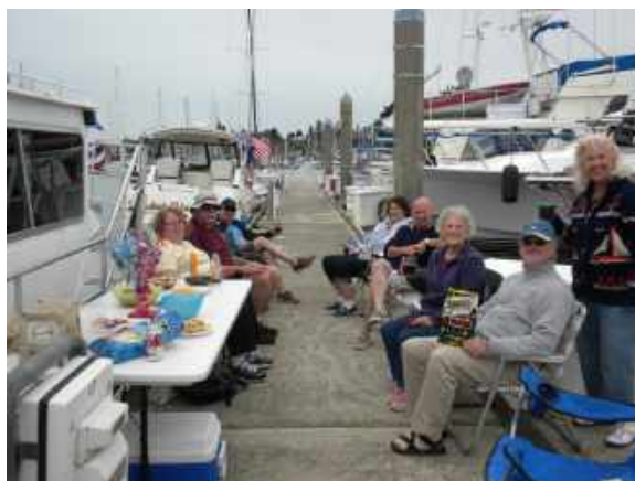
Bellingham July 4, 2014