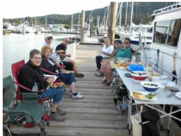
Ganges Potluck 2015