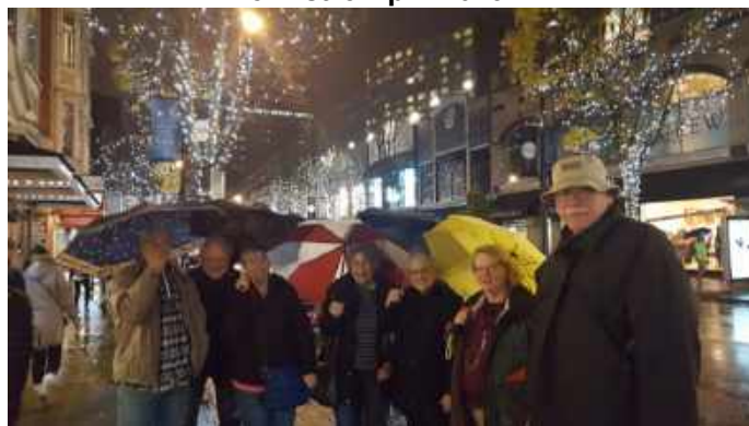
Vancouver in Rain 2017