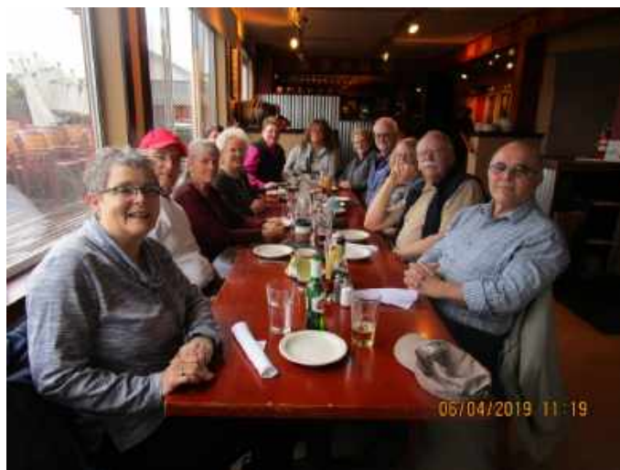
Primo Bistro April 2019