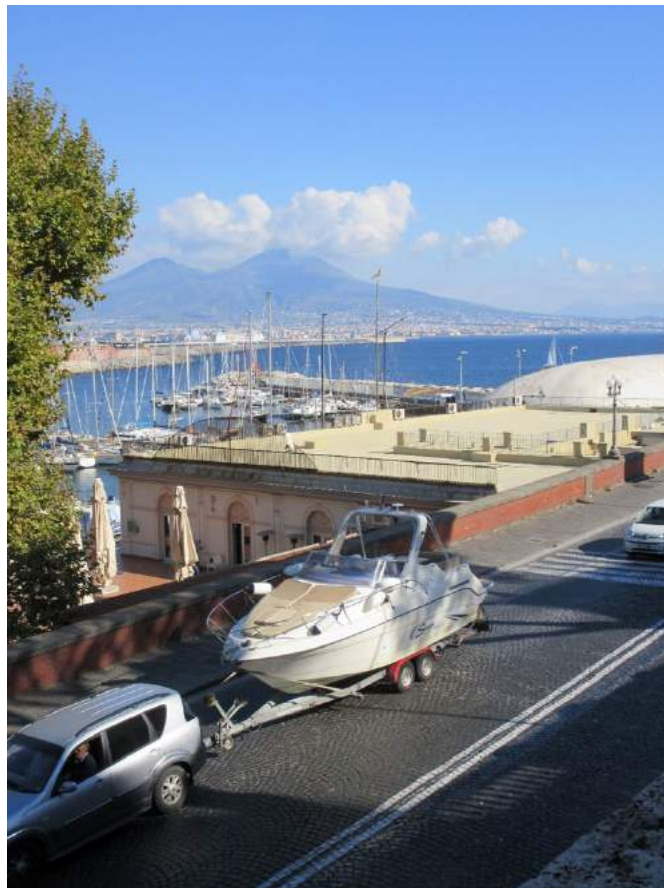
A boat in tow from the Naples marina. Notice the megalopolis all around Mount Vesuvius, an active volcano. When will it next erupt?