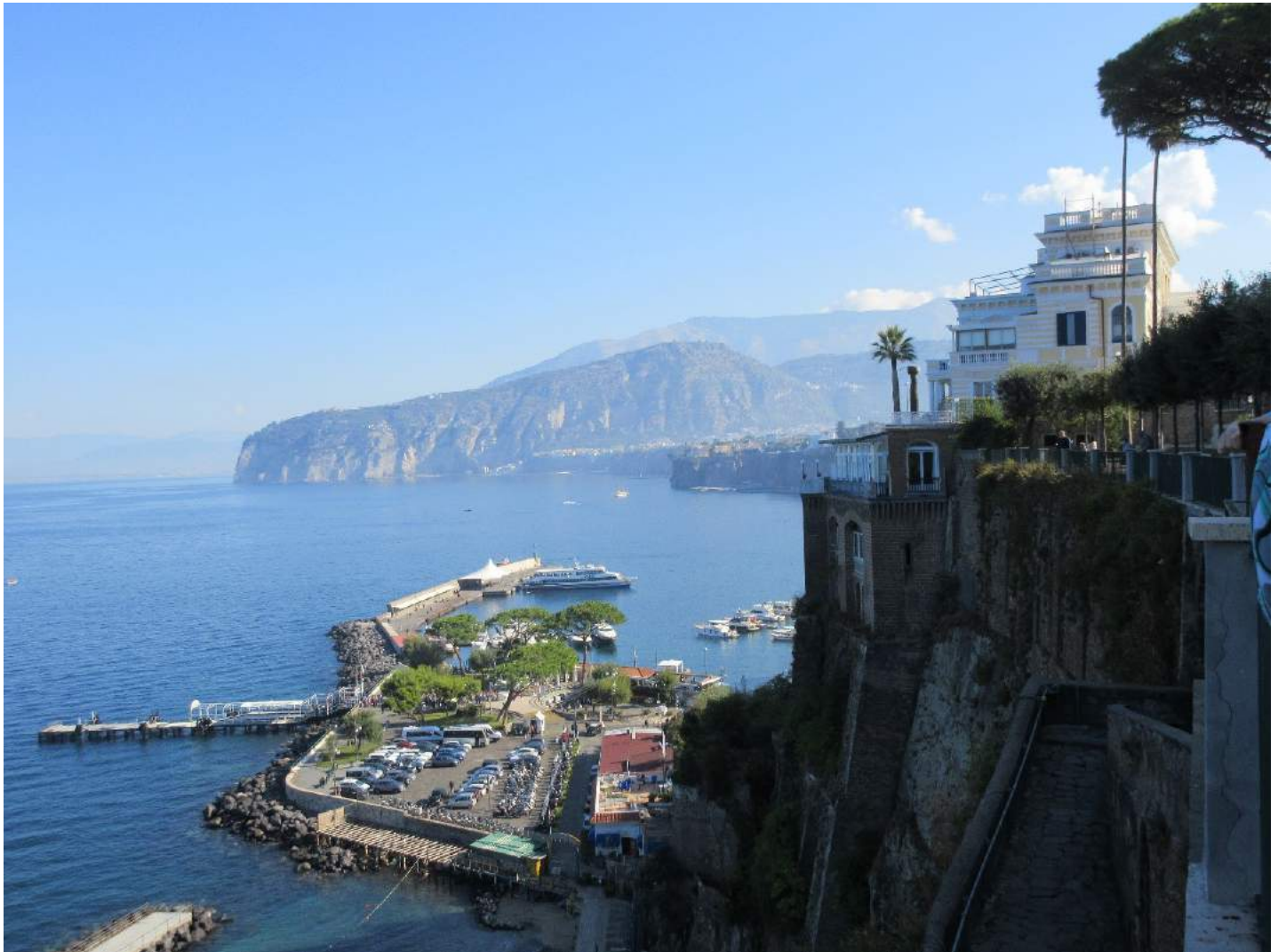
Our base the first week was Sorrento along the Amalfi Coast.

And now for something different: Since COVID is cancelling many activities, how about some boating activities in the Gulf of Napoli and the Gulf of Salerno along the Amalfi Coast in Italy (above the high instep of the boot on the west coast of Italy)? My doctor advised that is it safer in Italy now than it is in the U.S. for COVID, so with our three vaccinations, a flu shot, a test, a supply of masks, and lots of paperwork, off we went the last two weeks of October. We enjoyed a small boat ride along part of the Amalfi Coast, a medium sized boat day trip to the Isle of Capri, and an exhilarating small boat ride around part of the Isle where 4' waves prevented our going through the kissing rock and no one going into the Blue Lagoon.