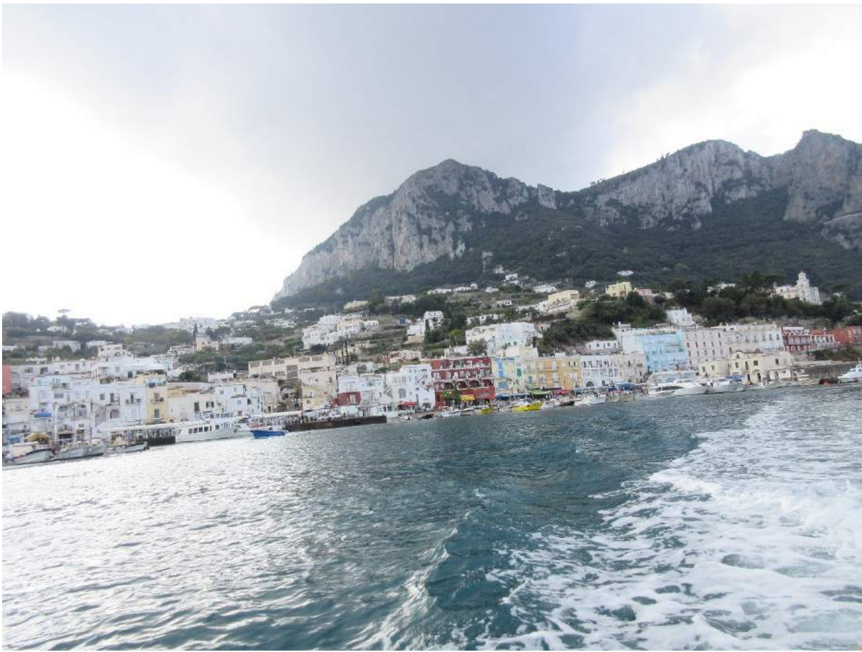
Leaving the Isle of Capri