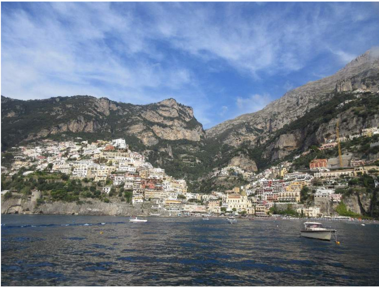
Above is Positano, as we left our day visit.