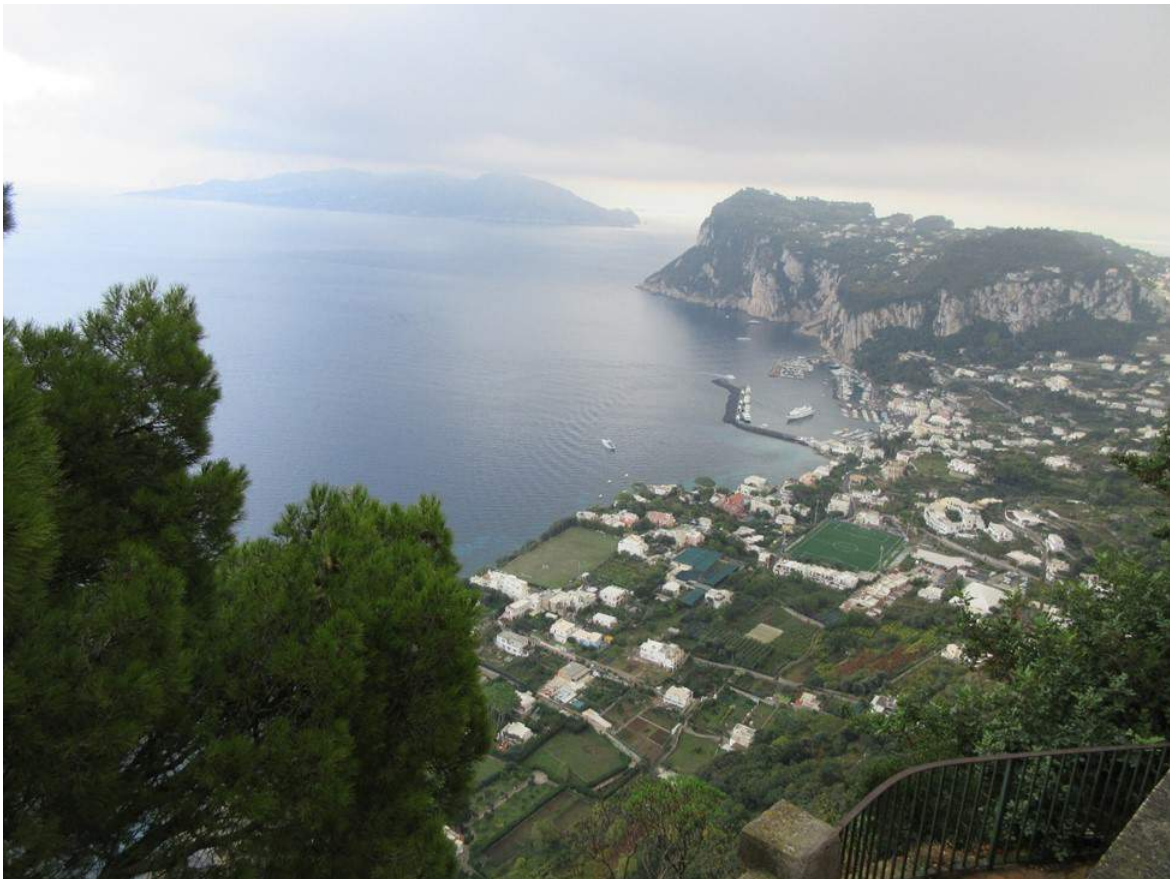
Isle of Capri view from Villa San Michele