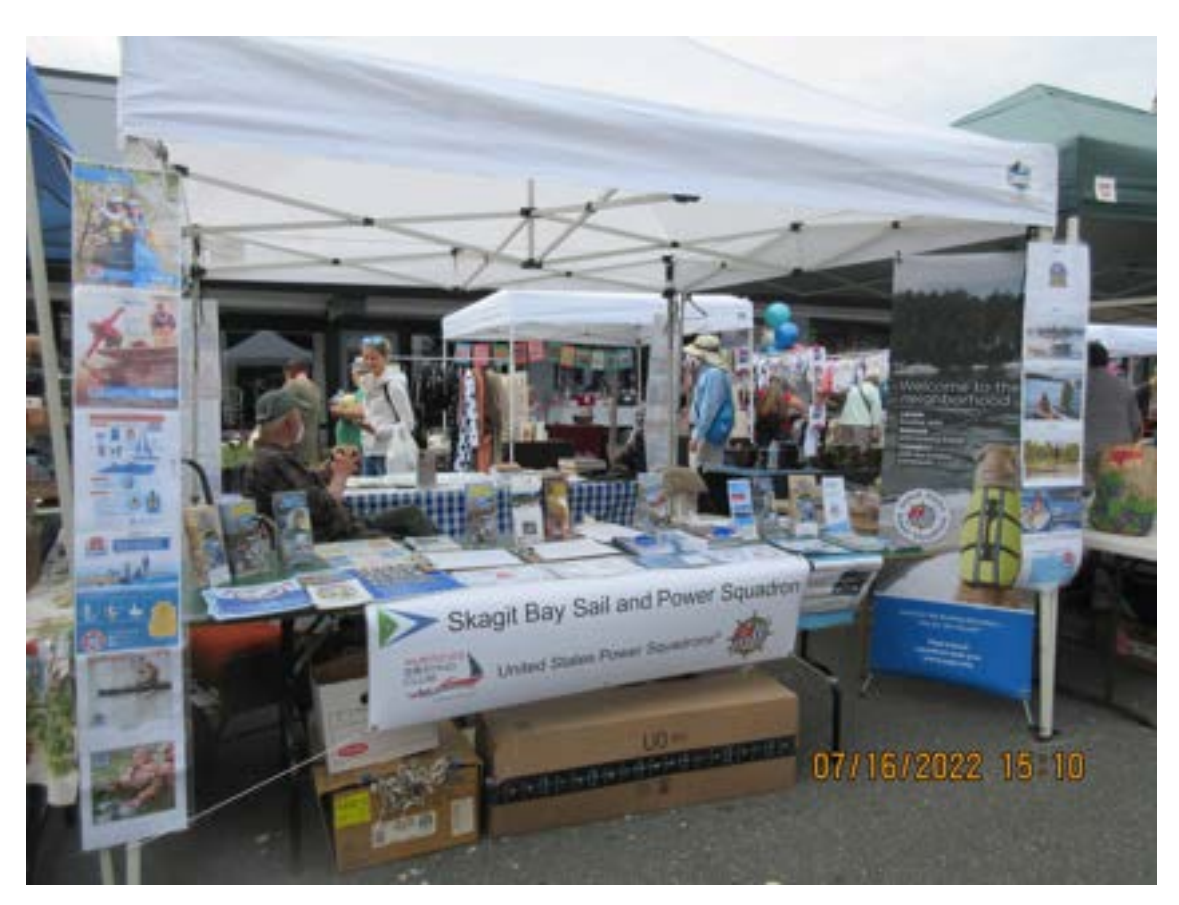
Our marketing display at Shipwreck Day and some of the nautical offerings at Shipwreck Day