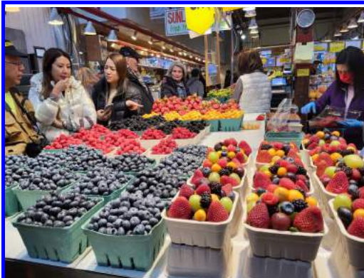
Interesting fruit stacks at Granville Island Market.

The General Meeting is Thursday, April 13 starting at 6 p.m. with a half-hour social hour, followed by a business meeting, dinner, and our Change of Watch.