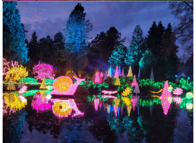
Van Deusen Garden