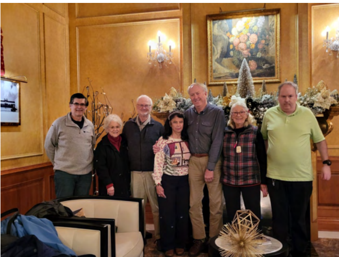
Group at Executive Hotel Le Soleil