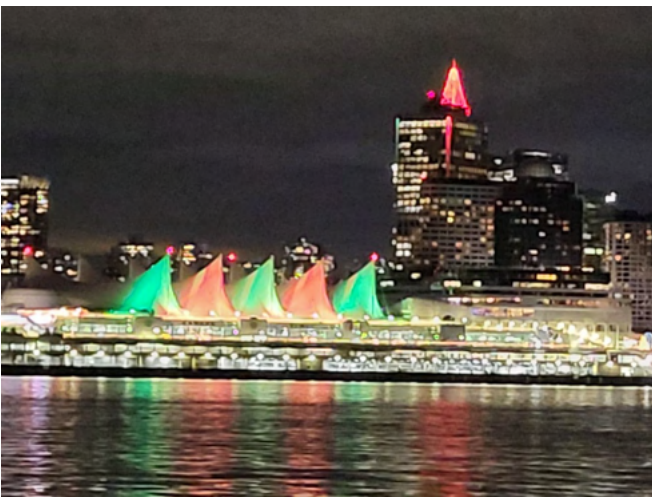
Canada Place from Dinner Cruise