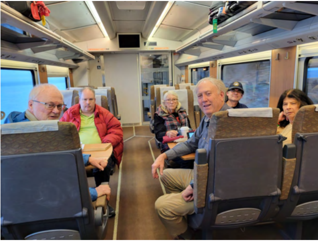
Group on Amtrak heading for Vancouver from Mt Vernon