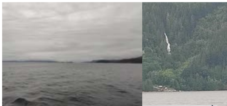
Assorted photos on the water underway.

Then back home to LaConner. We did spend the last night there so we could take all day cleaning next day. Love to have more of you come along next time. We are thinking again in a couple years and hitting some more spots and anchoring more.