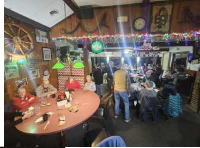
We celebrated more than I thought we would!